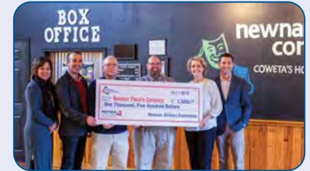
The Newnan Community Theatre Company newnantheatre.org