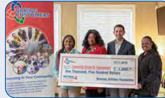
Community Action for Improvement cafi-ga.org