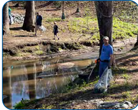
"Sweep the Hooch"