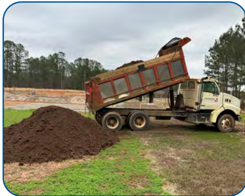
Crossroads Community Garden donation