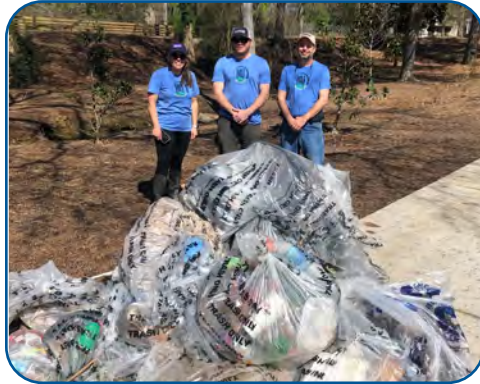
"Sweep the Hooch"