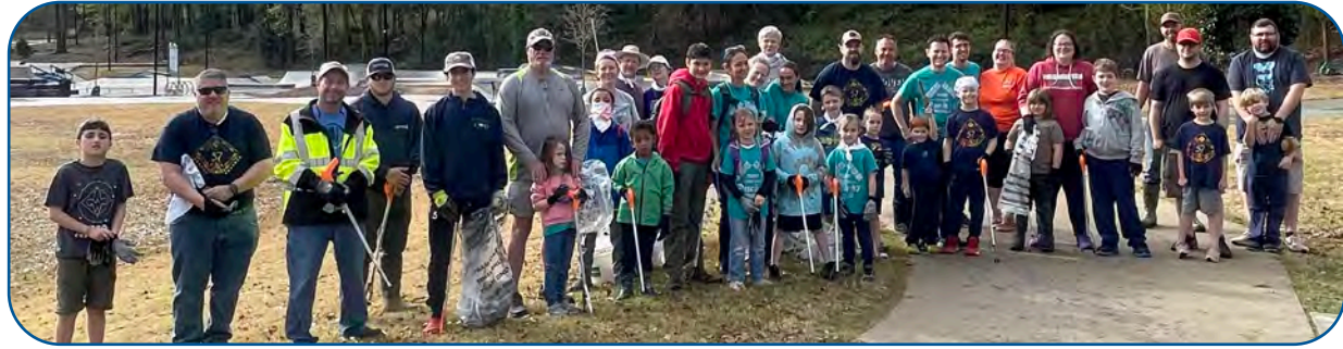
"Sweep the Hooch" event at C.J. Smith Park