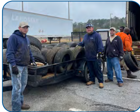
Keep Newnan Beautiful's Tire Amnesty Day