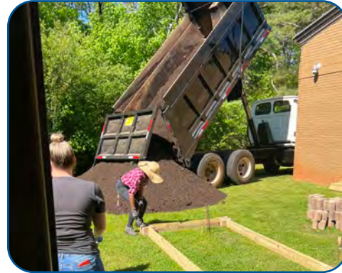
Evans Middle School compost donation