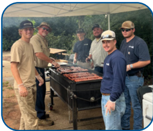
Cougar Community Cookout