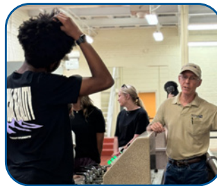
Newnan Youth Council tour