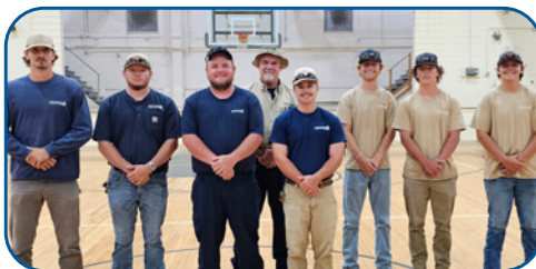
Coweta Family Connection Back to School Bash