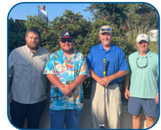
Coweta-Fayette EMC Operation Round Up Golf Tournament