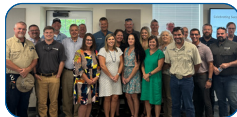
Professional Development Class with UWG