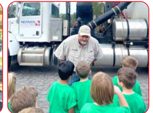
Career Days – Canongate Elementary