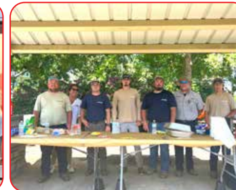
Cougar Community Cookout