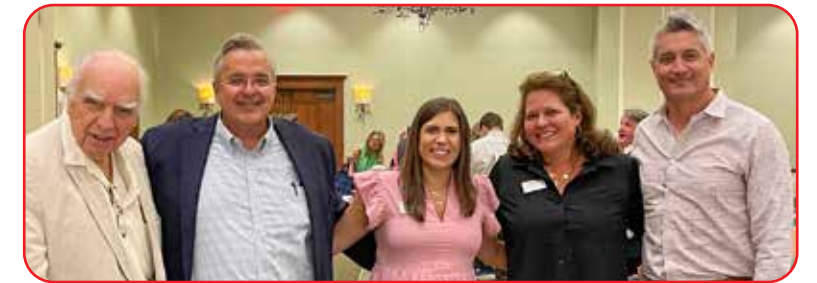
2023 Forward Coweta Summit