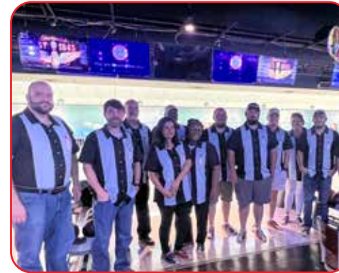
2023 Chamber Bowling Adventure