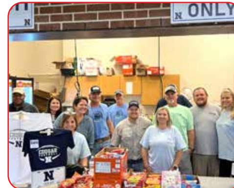
Newnan High School Concession Stand